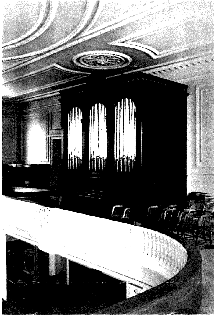
Figure 3 First Church of Christ, Lancaster, Wm. B. D. Simmons organ, 1869

Rebuilt by the Andover Organ Co., Methuen, Mass., 1963