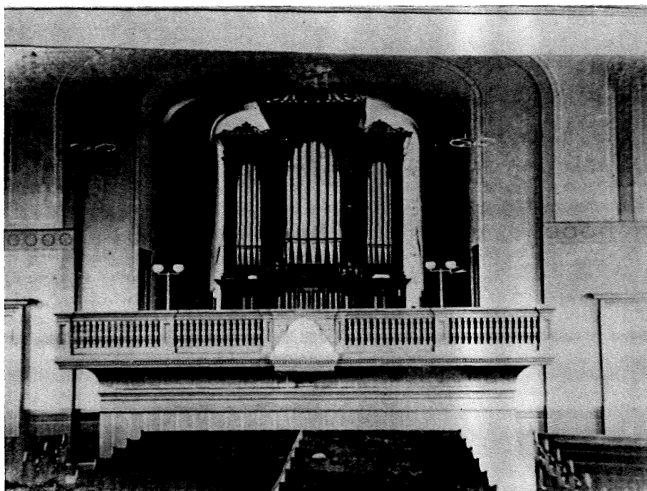
Figure 2 First Parish in Arlington, organ in former church, E. & G. G. Hook Opus #207, 1856, photo: courtesy Alan Laufman.

Arlington was originally part of Cambridge. The First Congregational Parish in Arlington was recognized in 1732 as "The Second" or "North-West Parish of Cambridge"; the first meetinghouse was built in 1734, and the church society was formally organized in 1739. When West Cambridge was set off from Cambridge in 1807, the church became the First Parish in West Cambridge, and was by then in a new church building constructed in 1804. In 1840, that structure was taken down, and a new one built on the same site, the corner of Massachusetts Avenue and Pleasant Street. (By that time, the First Parish had