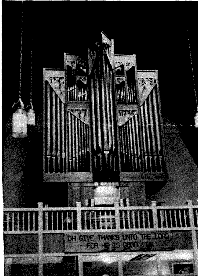
Figure 4 Messiah Lutheran Church, Fitchburg, Bozeman organ, Opus 45, 1989, photo: T. Lance Nicolls.

The organ was designed to serve the needs of the Lutheran liturgy and support fine hymnsinging, as well as to play the organ solo literature. It was felt that a 16' case was necessary for the proper visual proportions, hence the 16' Pedal Principal pipes in the facade. Actually low C and C# are behind the organ, because these two longest pipes would have made the case slightly too tall. Due to budgetary limitations the Bourdon 16', Spindle Flute 4', and Celeste 8' are prepared for future insertion.